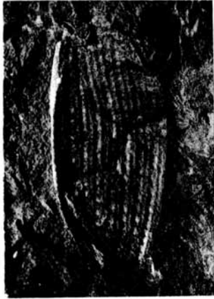
1a × 5.5