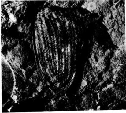
2a × 7