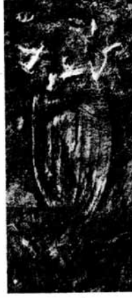
3 × 8