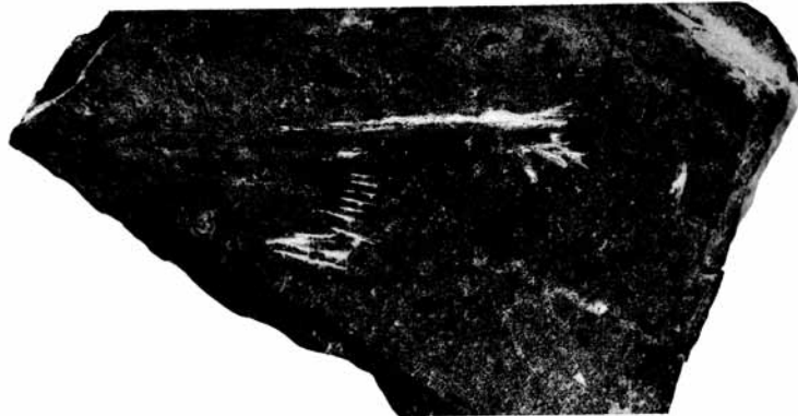
4 × 1.9