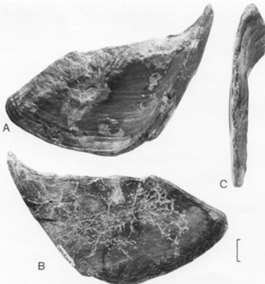
TEXT-FIG. 2. Amylodon karamysh sp. nov. SSU N.154/104, holotype left mandibular plate; Lower Campanian, Upper Cretaceous; Shyrokhi Karamysh, Saratov Region, Russia. A, medial; B, occlusal; C, lateral views. Scale bar represents 10 mm.

Systematic position. The mandibular dental plate is assigned to the genus Amylodon because it has extremely reduced tritors (contra Ischyodus , Edaphodon , Elasmodus , Pachymylus , Brachymylus , Callorhynchus , Chimaera and Harriota ), a straight outer margin (contra Elasmodectes ), and an upwardly elevated beak (contra Rhinochimaera ).